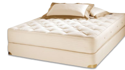
Natural Cotton w/Wool Wrap Mattress