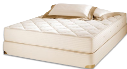
Premier Natural Latex Quilt-Top Mattress