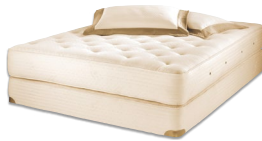
Premier Natural Cotton w/Wool Wrap Mattress