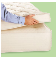
Premier Natural Pillowtop Pads